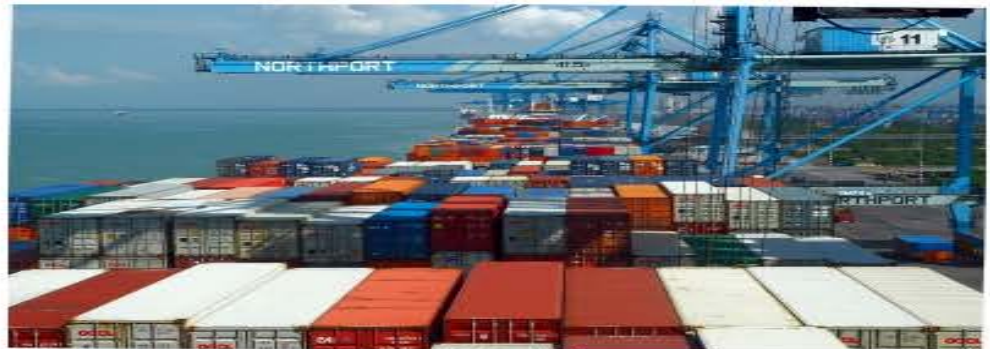
Shipping containers at Malaysia's Port Klang.

China announced at the start of the year that it would be banning imports of certain types of solid waste , including post-consumer plastics and mixed papers. This provoked panic in the UK recycling industry given that the UK – up until the start of the year – relied on China as an outlet for waste that could not be recycled domestically, sending around 494,000 tonnes of plastics and 1.4 million tonnes of recovered paper to China every year .